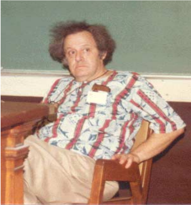
CDAS International Labour Conference, 1981

Born in Berlin on 16 September 1925 and died in Birmingham, England on 17 February 2001.